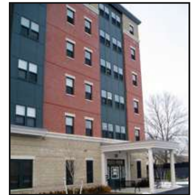
Geneva Avenue Elderly Housing